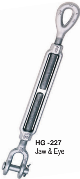
HG -227 Jaw & Eye