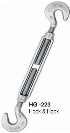
HG -223 Hook & Hook