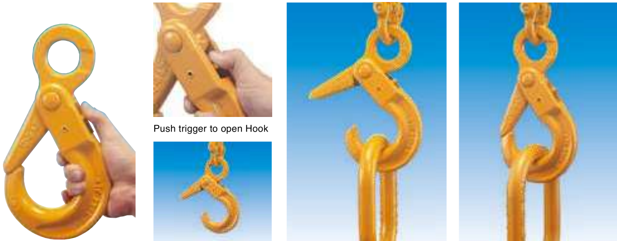
Push trigger to open Hook